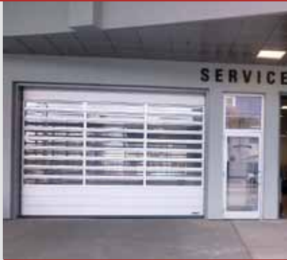
Auto Retail Installation Toronto, Canada

food processing, we have the high performance door you're looking for. The Hörmann Flexon product line gives you the ability to accommodate any door application with the right product from one manufacturer.