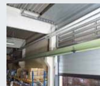
For limited clearance applications.

Non-contact built-in light grid The standard light grid is integral with the guide tracks making it less susceptible to damage and eliminates the need for additional protection devices such as a reversing edge and photocell. This system enhances protection of personnel and vehicles, drastically reducing the likelihood of damage, saving on maintenance costs when used in conjunction with motion or presence detectors.