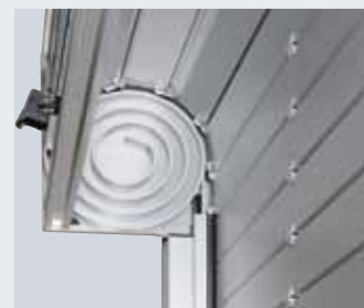
Non-contact prevents wear on panel.

In case of damage, unique panel connectors make it possible for individual sections to be quickly and easily replaced. This design minimizes maintenance, downtime and repair costs.