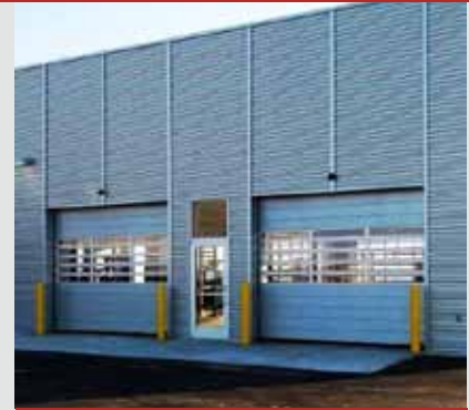
Auto Retail Installation Lubbock, Texas