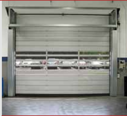
Auto Retail Installation Hampton, Virginia