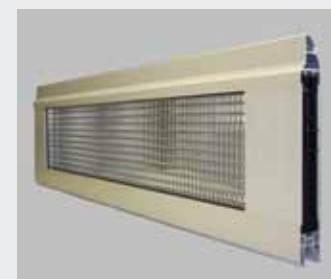
Ventilation and security.