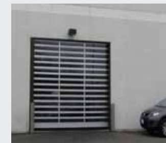
Complete vision (CV) model popular choice of automotive retail facilities.